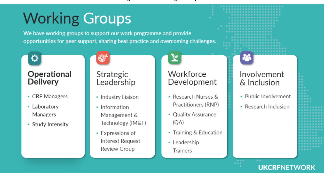
Figure 2: Working Groups